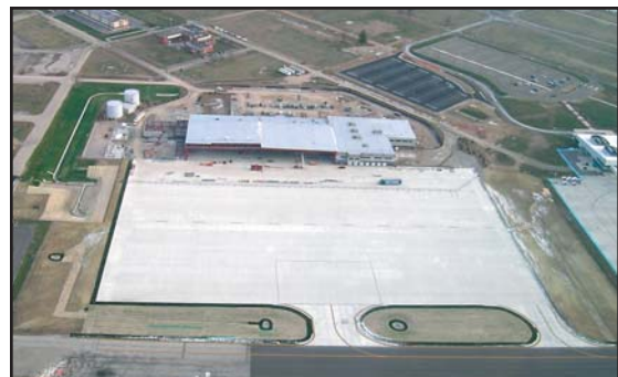
Nearly 47,000 square yards of PCC 10-inch concrete were poured over the course of 30 days for the new apron at Rickenbacker International Airport.